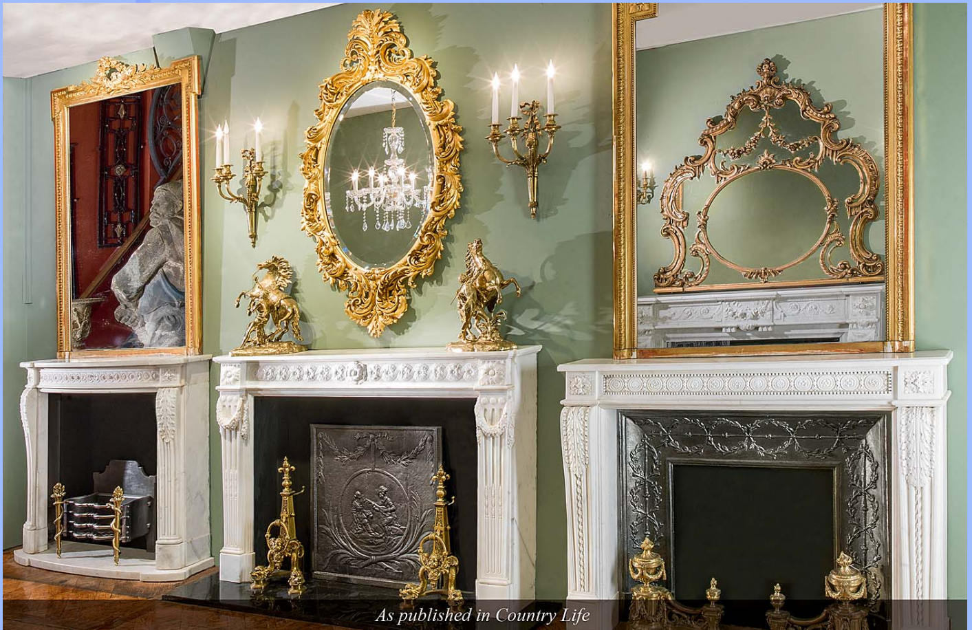
As published in Country Life

ANTIQUE PRESTIGIOUS CHIMNEYPieces ★ FIREGRATES ★ ORNAMENTATION ★ ARCHITECTURAL ELEMENTS